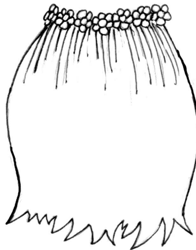
B. dress back